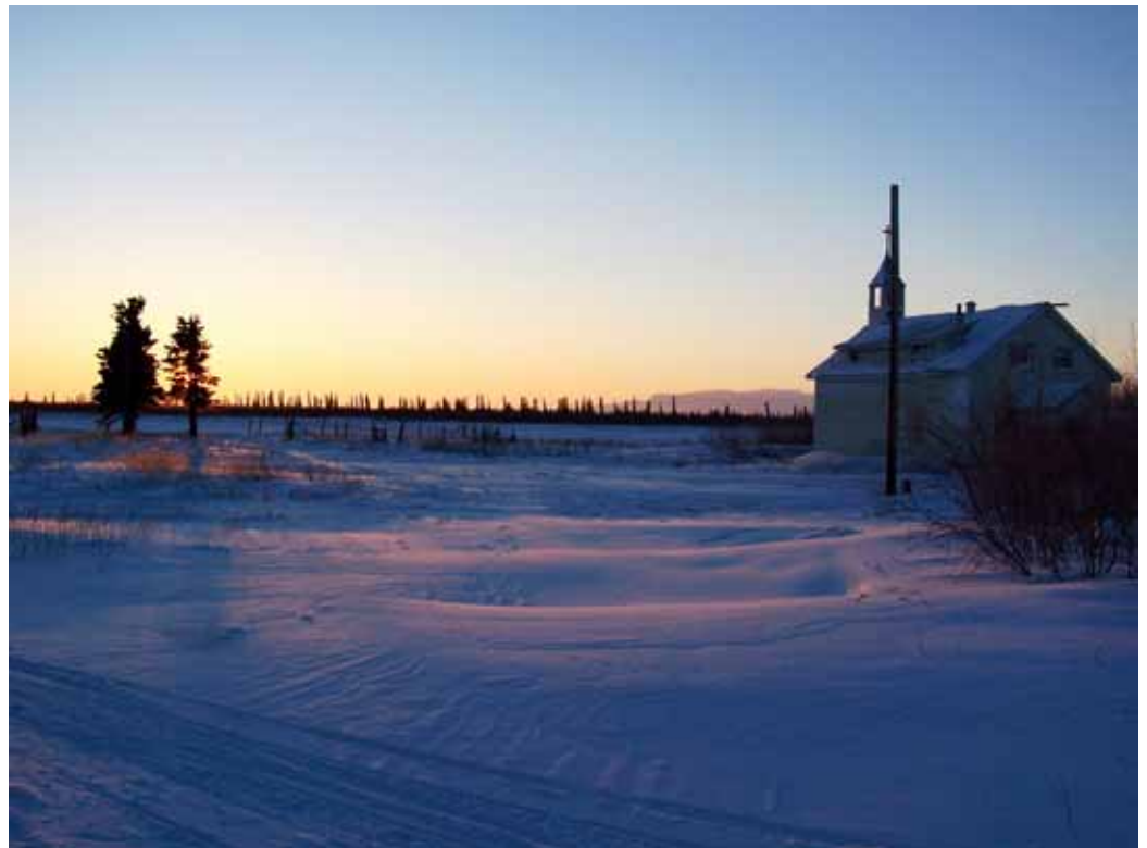
Gwich'in Land, Culture and Economy for a Better Future.

These benefits agreement provisions focus on priority contracting and employment for Gwich'in and suggest detailed procedures to ensure the proposed obligations are met by Imperial Oil.