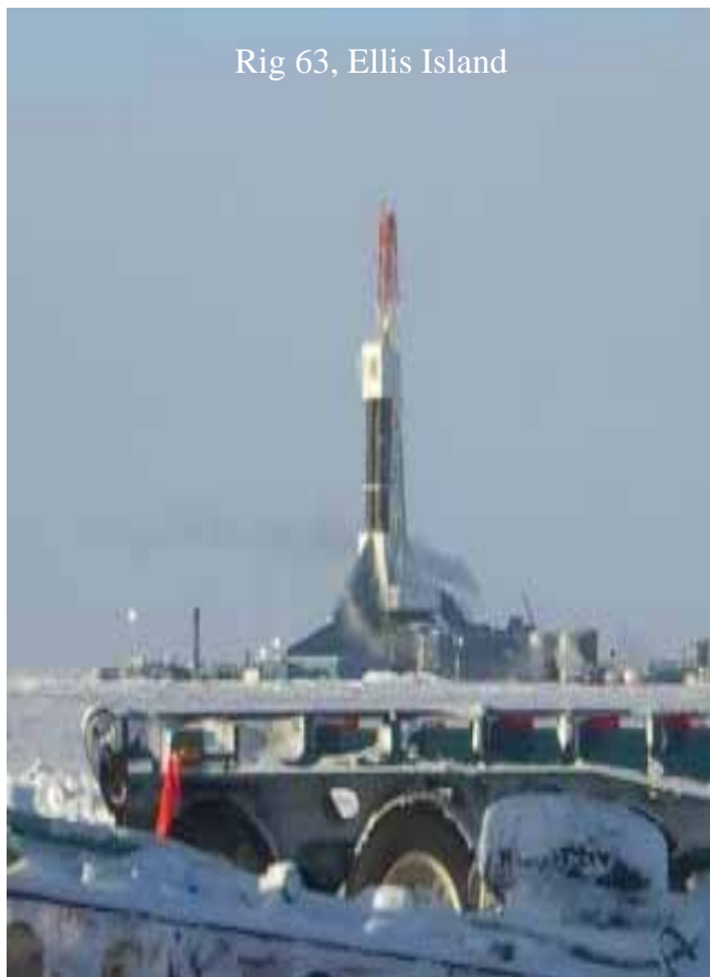
Rig 63, Ellis Island

knife called the “NWT Leader’s Network Forum 2005”. It was very interesting and informative. There were a number of workshops including: inspiring workplaces—creating a healthy happy and humane work environment, creating a living workplace for ongoing success and monitoring work-