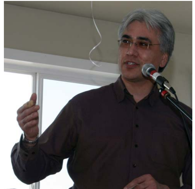
NWT Premier Floyd Roland makes a commitment to work with the Gwich'in on wellness issues.