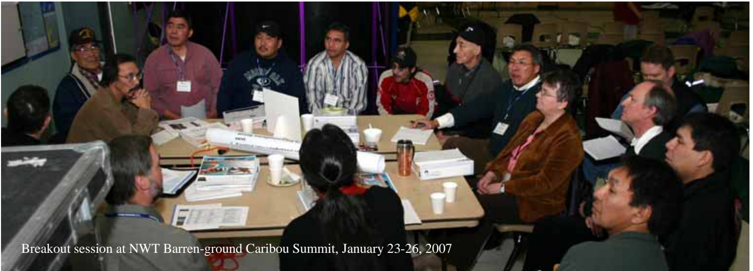
Breakout session at NWT Barren-ground Caribou Summit, January 23-26, 2007

Drin Gwiinzii. Hope everyone had enjoyable holidays.